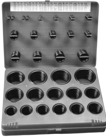
O-Ring Kit PART # 650-KIT-BN70