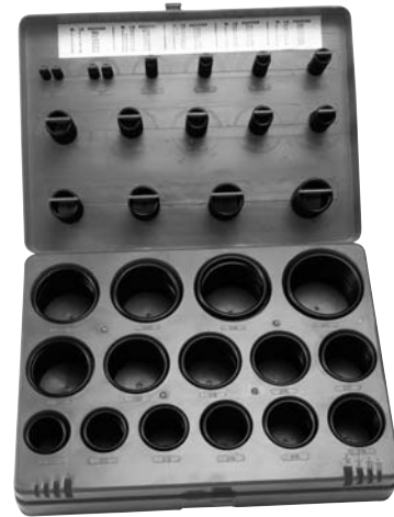
O-Ring Kit Metric PART # 651-KIT-BN70