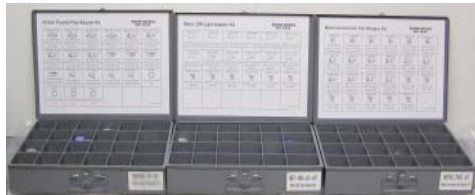
All kits include drawer (#DL24-C) and identification lid

Features: The kit includes a Metric and BSPP fitting gauge capable of identifying BSPP, BSPT, 24° DIN Metric, JIS, Kobelco, Komatsu, and 30°/60° Metric.